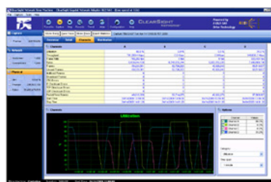
6Gb/s SAS-based NTM

ClearSight is first to announce the industry's first long-term network recorder based on 6 Gb/s (Gigabit per second) SAS (Serial Attached SCSI) drive technology, the fastest mechanical disk technology available in the industry. The Network Time Machines have always been designed around the RAID (Redundant Array of Independent Disks) standard to maximize capture performance; now using 6 Gb/s SAS drive components, ClearSight's network recorders are now able to capture and warehouse massive amounts of network data faster and more securely than any other solutions in the marketplace.