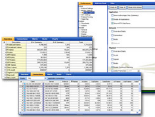
Network Time Machine 7.0

The emergence of more VoIP services over the next few years may attract organizations to use mobile VoIP more frequently. Meeting the challenge of maximizing the quality of service (QoS) related to voice transmissions in wireless communications, ClearSight is now able to deliver a high quality end-to-end mobile VoIP experience. The NTM 7.0 captures and analyzes data from audio and visual network transmissions - such as video conferencing, multimedia entertainment services, telemedicine, surveillance, live video broadcasting and video-on-demand - and makes meaningful measurements using MOS, R-values and other metrics.